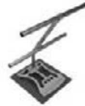
CONTOURED GUARDRAIL PANEL