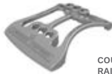
COUNTERWEIGHTED RAIL BASE

Designed to be easily installed section-by-section, the Portable Guardrail system quickly adapts to provide passive control of fall hazards. Portable guardrail is used with SafePro's patented ballasted guardrail base. All prefabricated railing sections are available in hot-dipped galvanized or powder coated safety yellow, or several available custom colors. Available in 5ft, 8ft, and 10ft lengths.