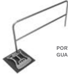
PORTABLE GUARDRAIL KIT