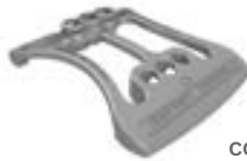
COUNTERWEIGHTED RAIL BASE

Component guardrail is designed for every project and features Strongtight components that ensure a solid feel throughout the system with minimal micromovements. Component guardrail provides passive fall protection that is site-specific and permanent. The SafePro patented ballasted guardrail base uses proprietary geometry to achieve maximum safety with minimal weight, and disperses weight across a large footprint to ensure that a roof's membrane is never compromised.