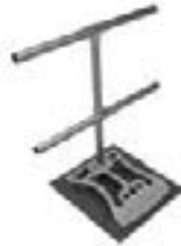
VERTICAL GUARDRAIL KIT