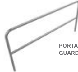
PORTABLE GUARDRAIL PANEL