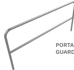
PORTABLE GUARDRAIL PANEL