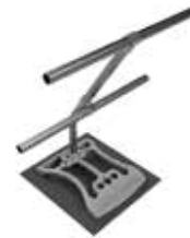
CONTOURED GUARDRAIL PANEL