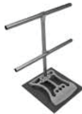
VERTICAL GUARDRAIL KIT