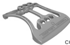
COUNTERWEIGHTED RAIL BASE

Component guardrail is designed for every project and features Strongtight components that ensure a solid feel throughout the system with minimal micromovements. Component guardrail provides passive fall protection that is site-specific and permanent. The SafePro patented ballasted guardrail base uses proprietary geometry to achieve maximum safety with minimal weight, and disperses weight across a large footprint to ensure that a roof's membrane is never compromised.