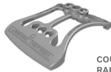
COUNTERWEIGHTED RAIL BASE

Designed to be easily installed section-by-section, the Portable Guardrail system quickly adapts to provide passive control of fall hazards. Portable guardrail is used with SafePro's patented ballasted guardrail base. All prefabricated railing sections are available in hot-dipped galvanized or powder coated safety yellow, or several available custom colors. Available in 5ft, 8ft, and 10ft lengths.