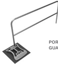
PORTABLE GUARDRAIL KIT